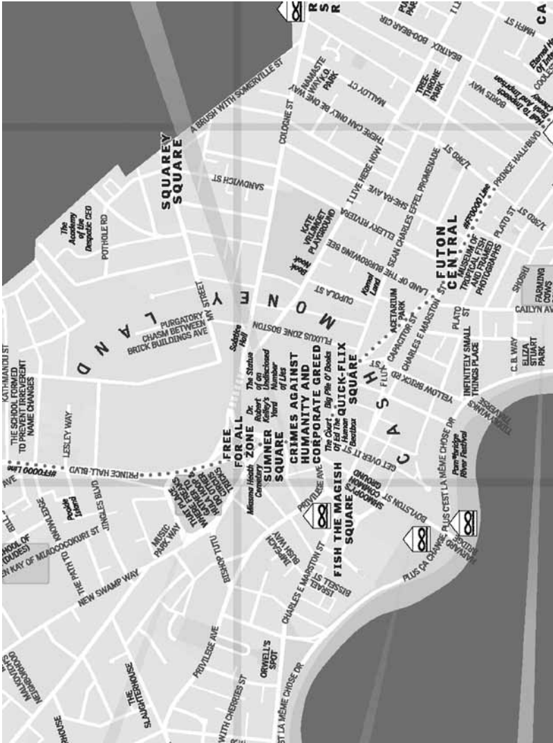
Figure 2.4 Map of the City Formerly Known as Cambridge, 2008, Detail. People had many creative and critical suggestions for the areas around Harvard Square and Central Square.