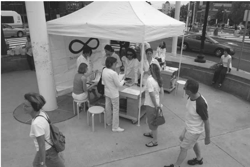
Figure 2.2 The Institute Staged 13 Renaming Parties Across the City of Cambridge.

The renamings took place in a series of thirteen “renaming parties” staged in different locations around the city. At each site, the Institute erected our large white tent, a banner that said “The Institute for Infinitely Small Things” and set up two renaming stations along with a research library where people